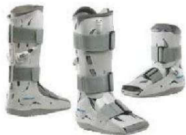
5. ----- THE AIRCAST FAMILY OF WALKING BOOTS