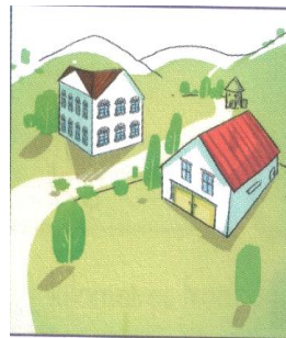
c. in the mountains