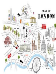
b. in a big city