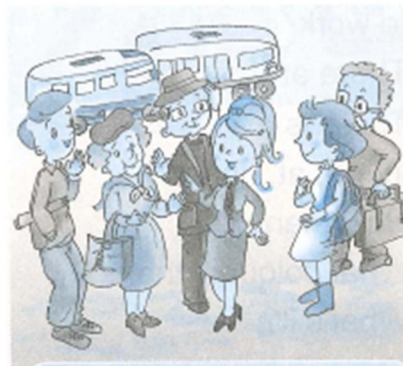
AUNT, tour guide